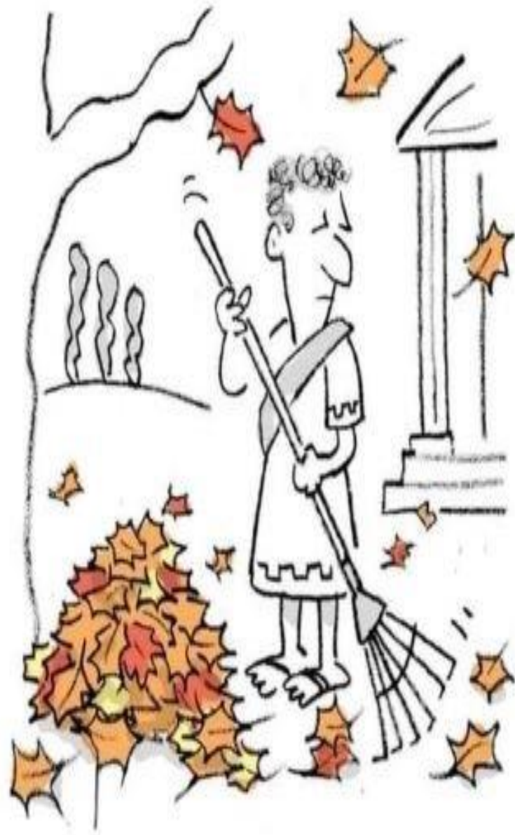
THE FALL OF THE ROMAN EMPIRE